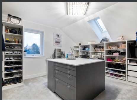
26 Hatton Road Perth