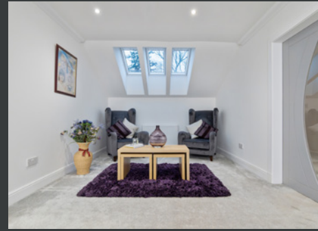
26 Hatton Road Perth